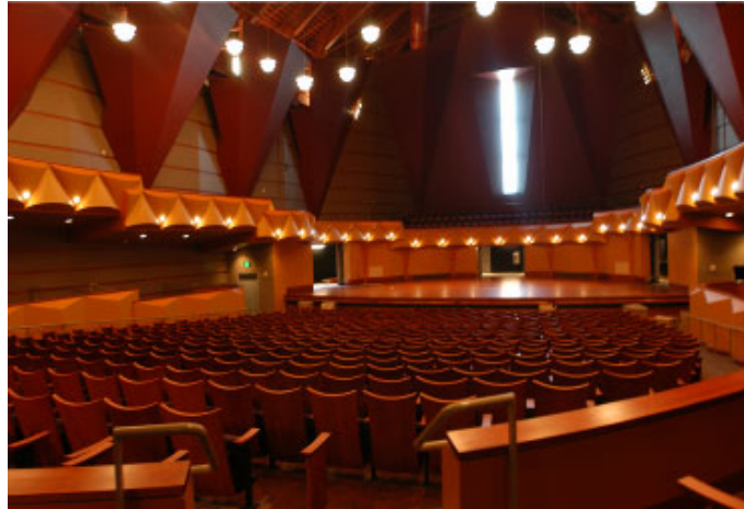
Performing Arts Concert Hall (opening January 2006)

http://d-c.fullerton.edu/project_highlights/index.htm .