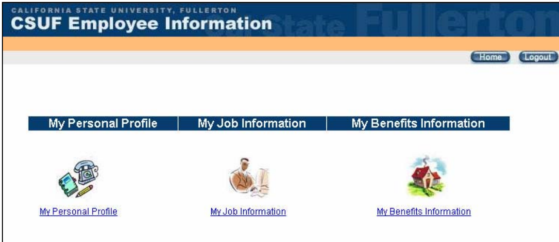
Screen shot of new Benefits Portal

The CSUF Faculty-Staff Portal now contains personal and benefits information for all full and part-time faculty and staff (see the screen shot below). Click on My Personal Profile to view and update personal information such as home address, telephone numbers, and emergency contact information. Certain job and benefits information can also be viewed. Leave balances will be available in the near future. If you have difficulty accessing your portal or benefits information, please contact the campus Help Desk at 7777.